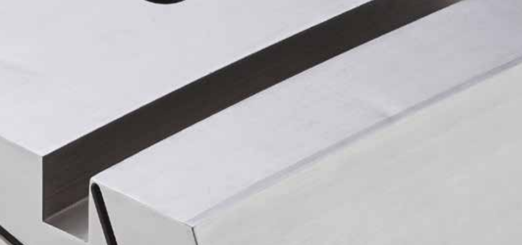
COATED SHROUD HR 120