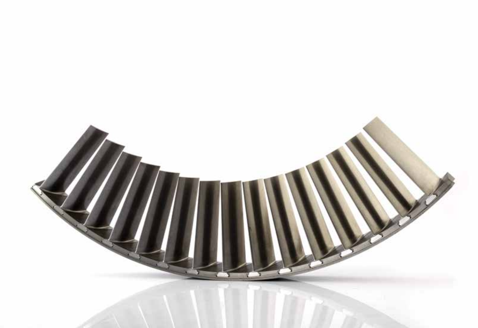
BLADES & RING ASSEMBLY