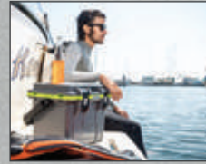
PELICAN ELITE COOLERS