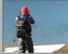
URBAN AND SPORT BACKPACKS